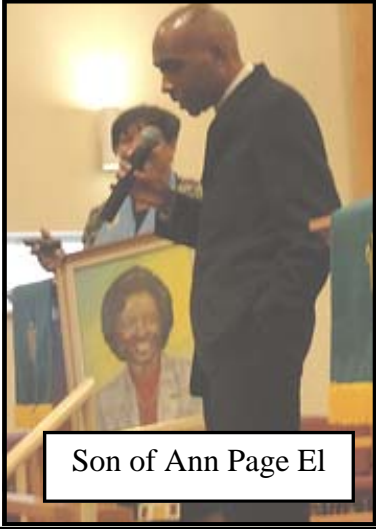
Son of Ann Page El