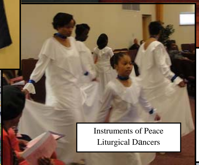
Instruments of Peace Liturgical Dancers